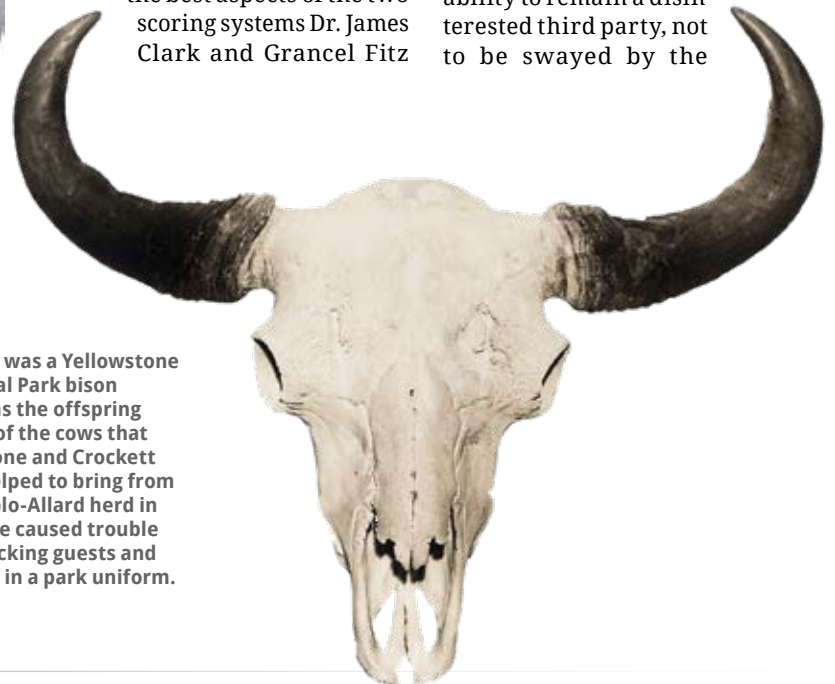
Old Tex was a Yellowstone National Park bison that was the offspring of one of the cows that the Boone and Crockett Club helped to bring from the Pablo-Allard herd in 1902. He caused trouble by attacking guests and anyone in a park uniform.