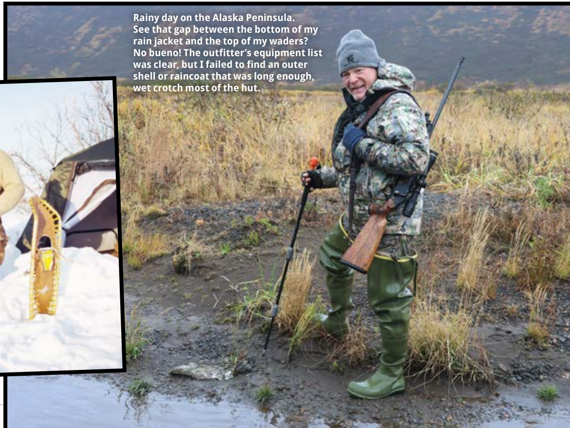
Rainy day on the Alaska Peninsula. See that gap between the bottom of my rain jacket and the top of my waders? No bueno! The outfitter's equipment list was clear, but I failed to find an outer shell or raincoat that was long enough, wet crotch most of the hut.