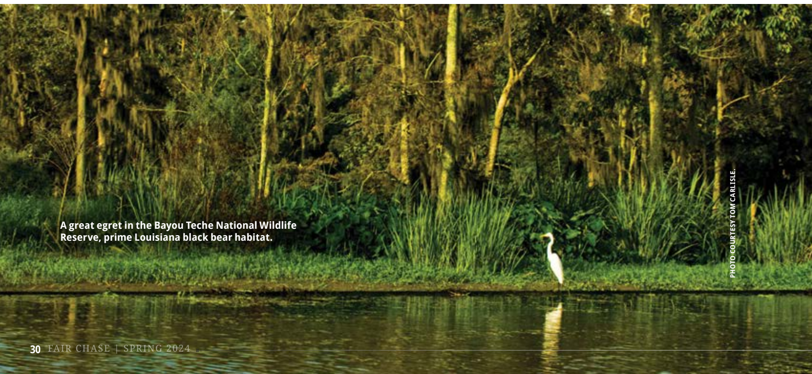
A great egret in the Bayou Teche National Wildlife Reserve, prime Louisiana black bear habitat.

In addition to private land conservation, Cummins and the Club worked with