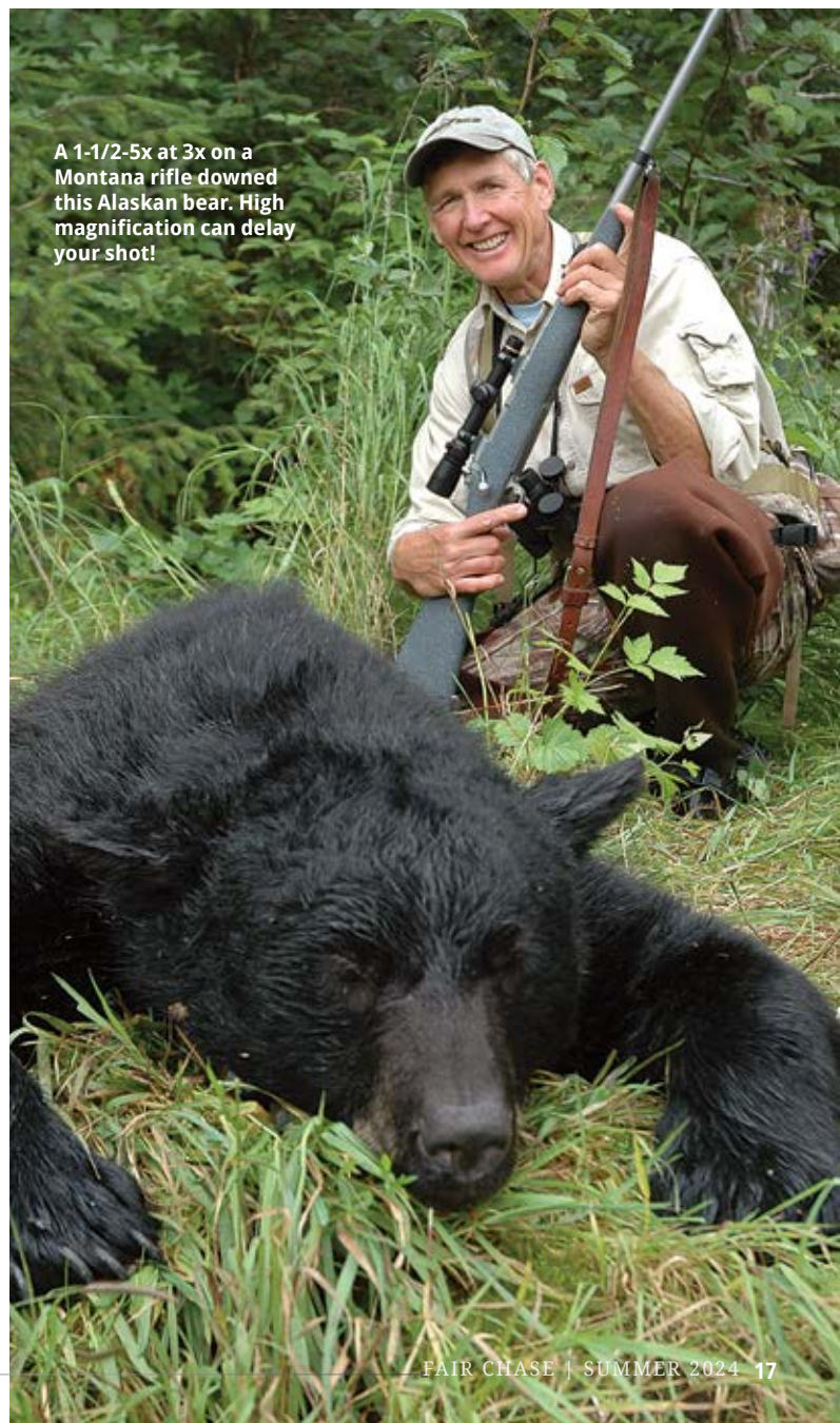
A 1-1/2-5x at 3x on a Montana rifle downed this Alaskan bear. High magnification can delay your shot!