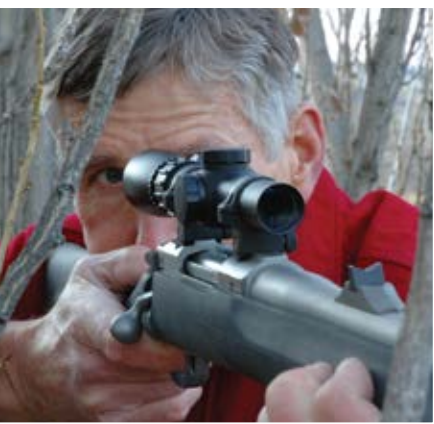
Short, lightweight, low-power scopes keep the rifle’s balance low between your hands, to point fast.

A hunting scope should help you aim quickly and accurately without thinking. Its full field must come to eye as you cheek the rifle. Weight that impairs rifle handling and adjustments that pull your focus from the target will only cause you to miss your chance. ■