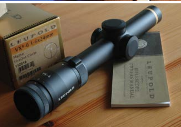
A fine lightweight optic easy to mount low, Leupold's 30mm 1-6x has all the power you should need!