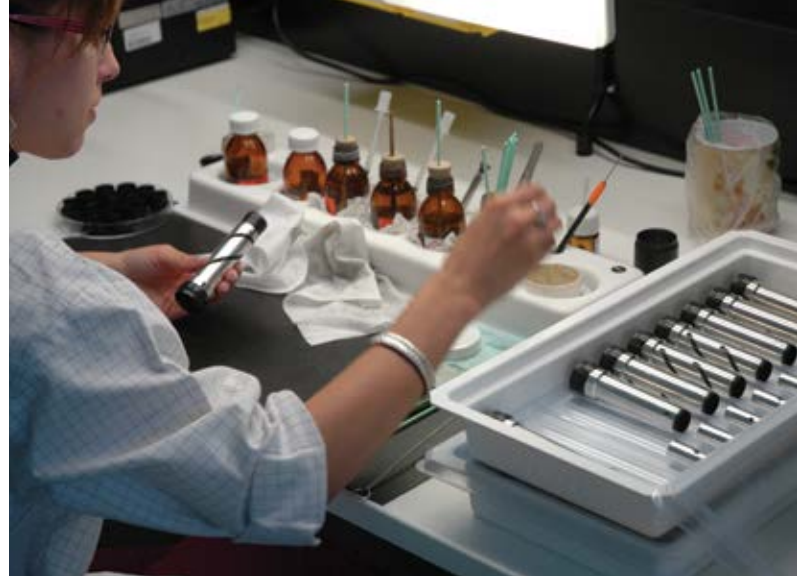
ABOVE: A technician completes erector assemblies. The variable scope's power ring engages those spiral slots. BELOW: Left to right, steps in machining a scope tube from a thick-walled blank. CNC machines hold close tolerances.

To no one's surprise, wide-range variables cost more than their forebears. The Balvar 8, a 2-1/2-8x made by Bausch & Lomb from 1955 to '63, sold for $99.50. It weighed 12 ounces (without the adjustable mount) and had a truly useful power range. Tides of 3-9x scopes followed. The generous field of a 2-1/2-power scope (40 to 45 feet at 100 yards) affords quick aim partly because it almost duplicates what you see with your naked eye. There's no time lost adjusting your vision to a magnified image. It also reveals animals not encompassed by a tighter