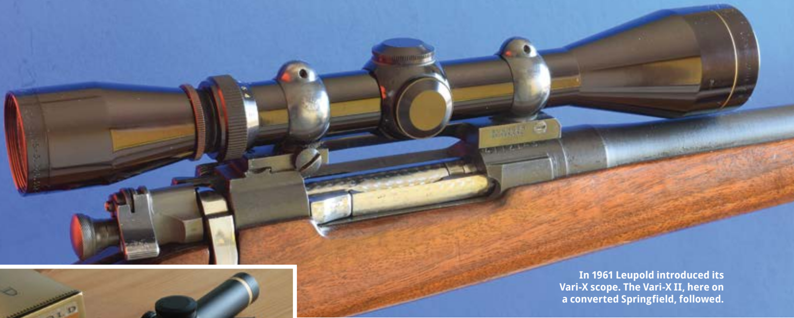
In 1961 Leupold introduced its Vari-X scope. The Vari-X II, here on a converted Springfield, followed.