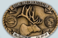
ELK - NON-TYPICAL