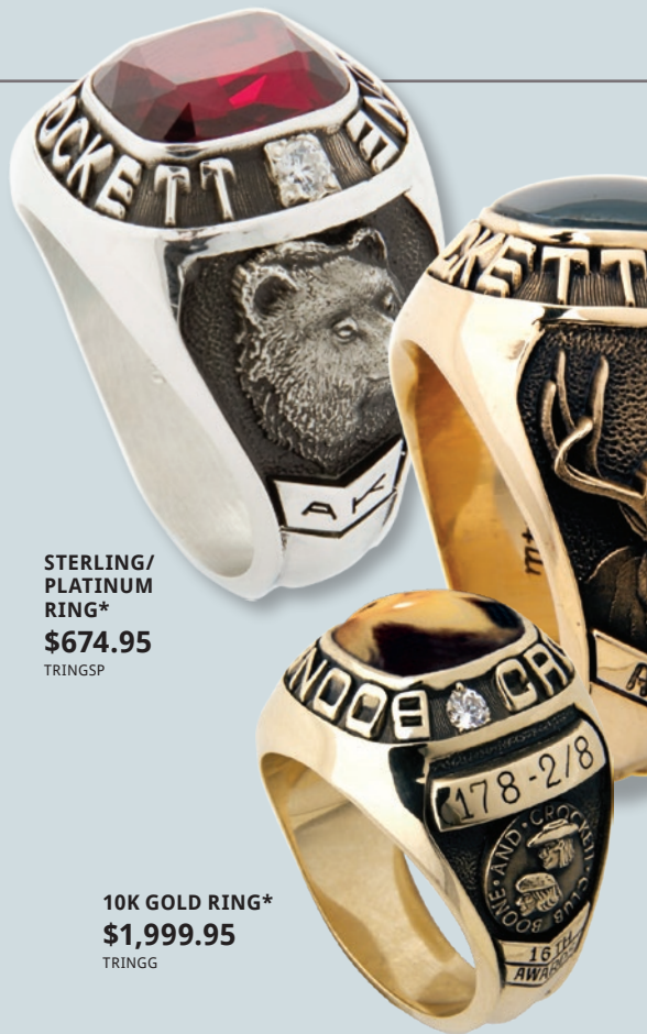
STERLING/ PLATINUM RING* $674.95 TRINGSP

If you do not know your ring size it is recommended that you visit a jeweler for sizing or call and we will send you a ring-sizing template. Ring sizes are available from 7.5 to 16+. For ladies' rings or sizes 7 and under, call 406-542-1888 for special discounted pricing.