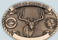
MULE DEER - TYPICAL