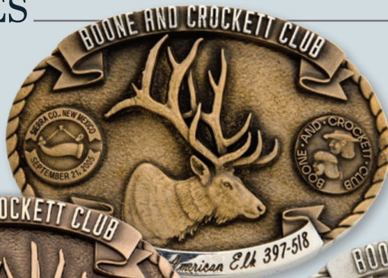
GOLD PLATE OVER STERLING SILVER BELT BUCKLE ACTUAL SIZE: 3.75"X2.75"