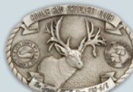
MULE DEER - NON-TYPICAL