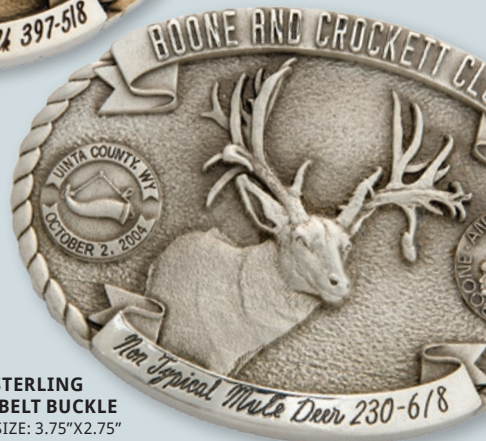
SOLID STERLING SILVER BELT BUCKLE ACTUAL SIZE: 3.75"X2.75"