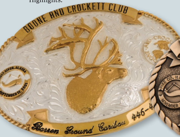
HAND-ENGRAVED STERLING SILVER BELT BUCKLE WITH 24K GOLD PLATED HIGHLIGHTS ACTUAL SIZE: 4.5"X3.25"

Like our popular rings, each belt buckle is custom-made for you and your trophy, including a relief of the category, location, harvest date, category name, and score. You can choose from three different styles: Bronze, Sterling Silver, or Sterling Silver with Gold Plate. We also have a Hand-Engraved Sterling Silver Belt Buckle with 24K Gold Plated Highlights.