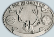
ELK - TYPICAL