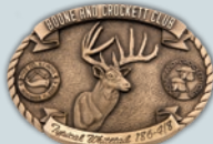
WHITETAIL - TYPICAL