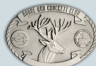
WHITETAIL - NON-TYPICAL