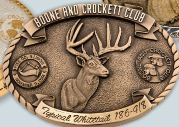
SOLID BRONZE BELT BUCKLE ACTUAL SIZE: 3.75"X2.75"