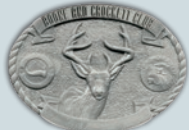
COUES' WHITETAIL - TYPICAL