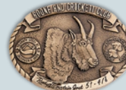
ROCKY MOUNTAIN GOAT