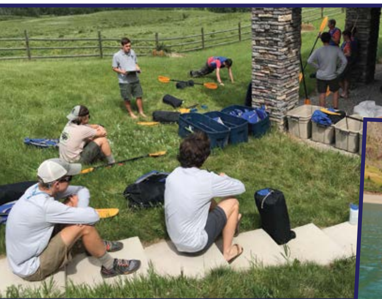
Day two of the MOHAB experience involves programs at base camp (RWCC) including trail meal packaging, group gear distribution, packraft training, expedition leadership and a shakedown hike.