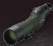
FIRST PRIZE STM 65 HD