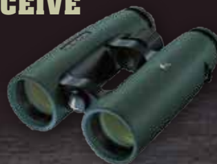
SECOND PRIZE EL 10x42 WB