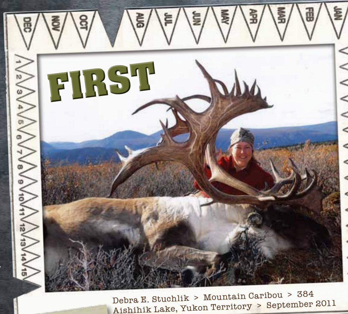
Debra E. Stuchlik > Mountain Caribou > 384 Aishihik Lake, Yukon Territory > September 2011

We hope you enjoy and pick up a few tips for the next time you're in the field.