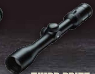
THIRD PRIZE Z3 3-9x36