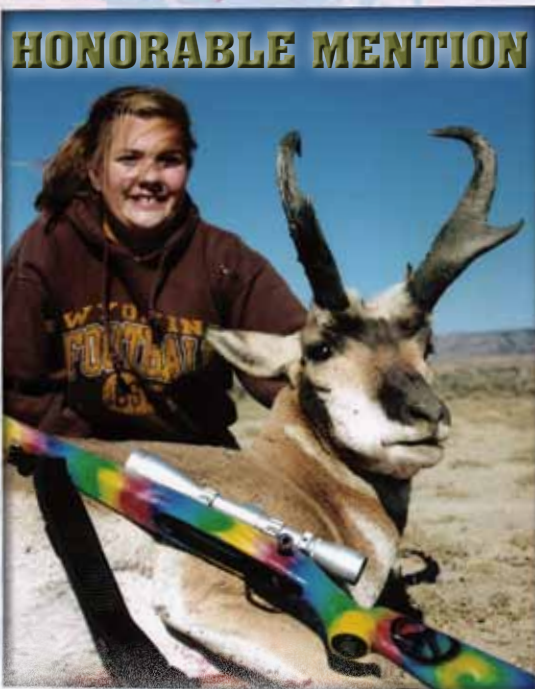
HONORABLE MENTION Generation Next