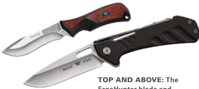
TOP AND ABOVE: The ErgoHunter blade and handle provide various grip possibilities. The Marksman straplock provides amazing strength to a folding knife. BELOW: The Paklite Kit's skeletal knives are light and easy to clean.