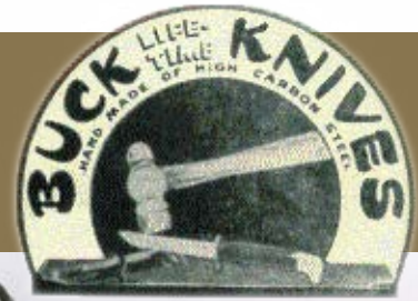
The original Buck Knives logo.

and all the while be resistant to corrosion. If you start with good steel and follow your heat treat process with fanatical precision, you will consistently draw the best of all three attributes from the steel. If you don't, you won't.