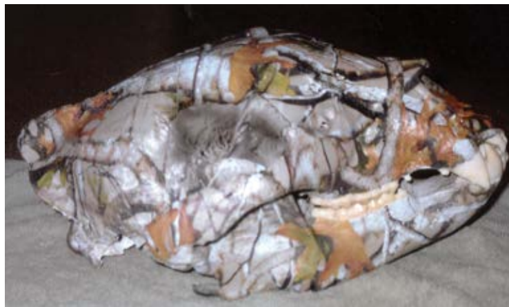
ABOVE: A painted bear skull like this cannot be measured. All bear and cat skulls entered in the records program must be completely free of paint at the time of measuring. BELOW: Deer, elk, caribou, and moose with three or more antlers arising from separate pedicels, such as this, are now eligible for entry in B&C's records program.

Contrary to what many people may think, Boone and Crockett Club creates new categories