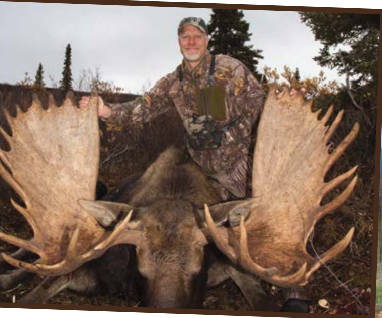
8-DAY CANADA MOOSE HUNT DONATED BY NORTHWEST BIG GAME OUTFITTERS

You have the opportunity to be a part of the history of the Boone and Crockett Club by purchasing the 1,000th Lifetime Associate spot. This would make a life-long gift for your child or grandchild.