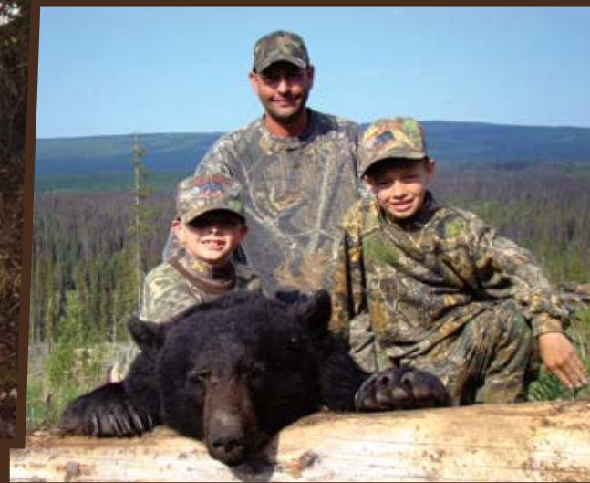
5 1/2-DAY BC BLACK BEAR HUNT DONATED BY SONNY'S GUIDING SERVICE