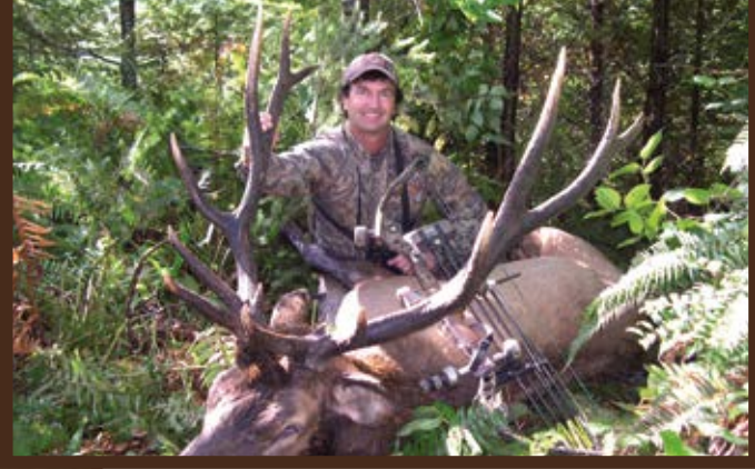
5-DAY OREGON ROOSEVELT'S ELK HUNT DONATED BY EDEN RIDGE OUTFITTERS