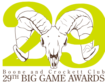
Boone and Crockett Club 29 TH BIG GAME AWARDS