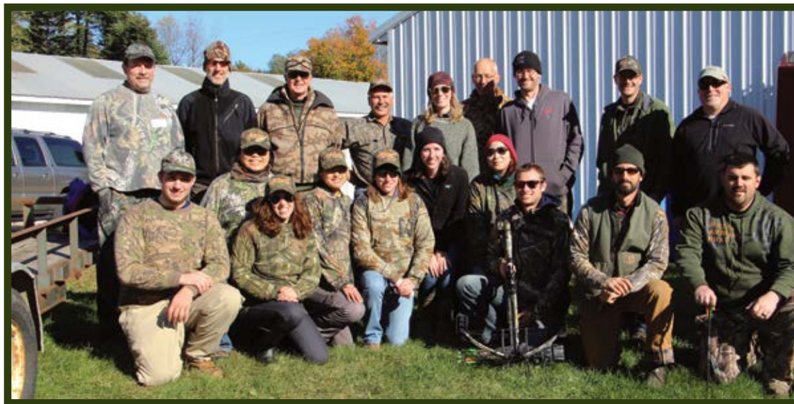
The Learn To Hunt Program students and mentors.