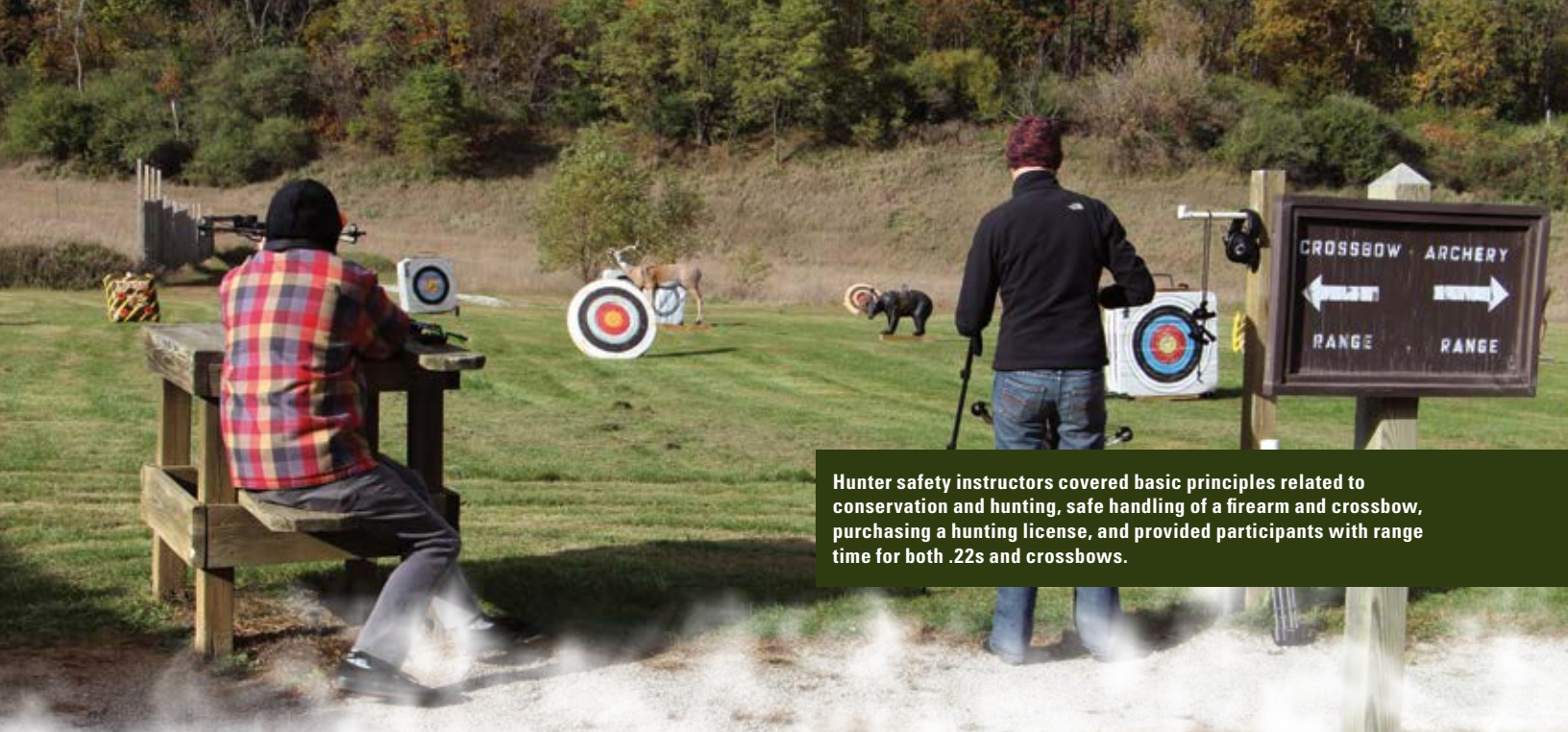
Hunter safety instructors covered basic principles related to conservation and hunting, safe handling of a firearm and crossbow, purchasing a hunting license, and provided participants with range time for both .22s and crossbows.

Traditionally, hunters have been recruited to hunting by family members, but the changing population demographics of the nation, urbanization, and other time commitments are leading to fewer hunters being recruited in this way. Reaching new audiences of adults interested in learning to hunt can be challenging. Many have grown up in urban areas or may have been exposed to negative perceptions of hunters. Some may have been interested in hunting but did not have a hunting mentor available to teach them. There are now growing interests in healthy, sustainable wild proteins among adults, and taking up hunting can be a logical link. The Michigan Learn to Hunt program was developed for these audiences and modeled after other efforts targeting new adult hunters, such as Minnesota's and Wisconsin's Learn to Hunt for Food programs and Kentucky's Hunter's Legacy program. In addition to covering the fundamentals of deer hunting, the Learn to Hunt curriculum was designed to teach participants about conservation, how hunting contributes to the economy, and how ethics and responsibility relate to hunting. Participants became certified in hunter and bowhunter safety and participated in a mentored deer hunt on the final evening of the session. Three men and seven women participated in the program, ranging in age from 18-34. While seven of the participants had previously participated in target shooting, only three had ever hunted (less than three times as an adult).