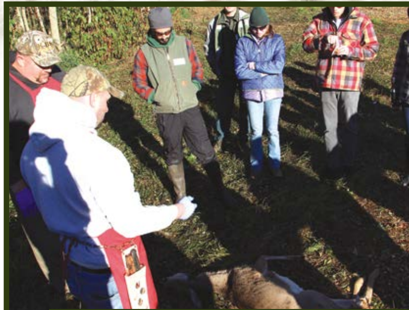
Participants were able to watch a field dressing of a previously harvested doe and then engaged in a hands-on processing demonstration (both led by the owner of a local butcher shop). Students enthusiastically helped to butcher the deer and learned about the different cuts of meat.

The first day of the session was held on a Friday evening at the Demmer Shooting Sports, Education, and Training Center on the Michigan State University campus. Hunter safety instructors covered basic principles related to conservation and hunting, safe handling of a firearm and crossbow, purchasing a hunting license, and provided participants with range time with both .22s and crossbows. The second program session was held the following Saturday at a Michigan Department of Natural Resources (DNR) field office and adjacent shooting range. Students learned about hunter ethics and responsibilities, proper equipment needed to hunt deer, and