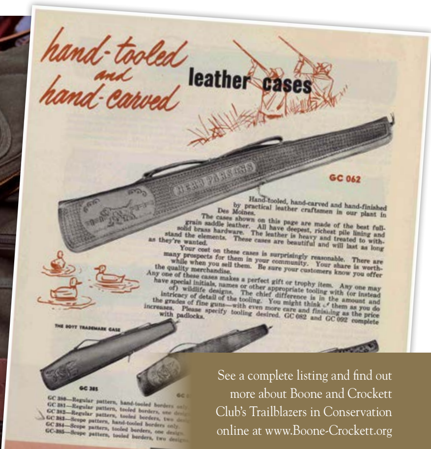
See a complete listing and find out more about Boone and Crockett Club's Trailblazers in Conservation online at www.Boone-Crockett.org