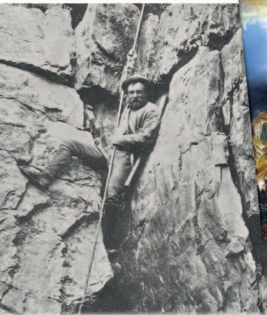
ABOVE: Clarence King