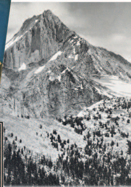
ABOVE: Mount Clarence King