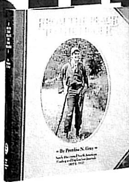
From the Peace to the Fraser $49.95