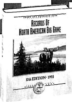
Records of North American Big Game 10th Ed. - $49.95