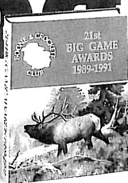
21st Big Game Awards 1989-1991 $39.95