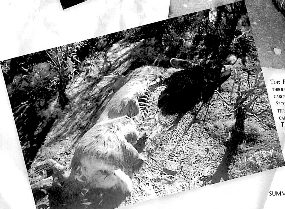
TOP: PAUNSAUGUNT BUCK SHOT THROUGH THE BACK, ONE ANTLER WAS BROKEN OFF. THE CARCASS WAS LEFT TO ROT. SECOND FROM THE TOP: PAUNSAUGUNT BUCK SHOT THROUGH BACK, HEAD AND CAPE REMOVED. AGAIN THE CARCASS WAS LEFT TO ROT. THIRD: ANOTHER PAUNSAUGUNT BUCK SHOT THROUGH THE HINDQUARTERS. WILDLIFE ENFORCEMENT OFFICIALS BELIEVE IT WAS LOST BY POACHERS. BOTTOM: THIS PAUNSAUGUNT BUCK WAS SHOT THROUGH THE NECK, THE ANTLERS WERE REMOVED AS WELL AS THE BACKSTRAPS AND THE CARCASS WAS LEFT.