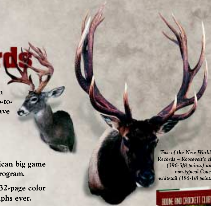
Two of the New World's Records – Roosevelt's elk (396-5/8 points) and non-typical Coues' whitetail (186-1/8 points)