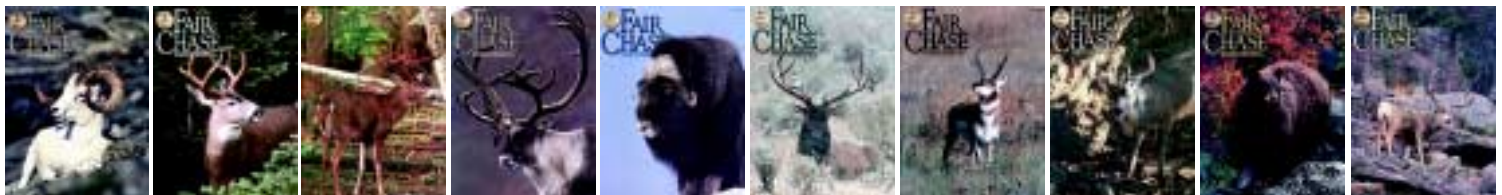
WINTER 94 SPRING 94 SUMMER 94 FALL 94 WINTER 95 FALL 95 WINTER 96 SPRING 96 SUMMER 96 SPRING 97