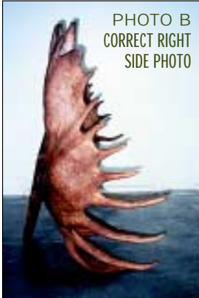
PHOTO B CORRECT RIGHT SIDE PHOTO

abnormal points on the right antler that total 16-6/8 inches and one on the left that is 2-6/8 inches long. Since it is the first and only one accepted to date, I guess we could say it is a potential World's Record. Actually, the top 10 specimens entered in both new non-typical categories will be invited to the 25th Awards Program Final Judging that will take place in 2005. The largest one in each category will be declared the World's Record at that time.