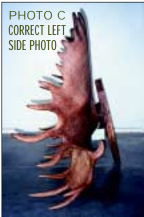
PHOTO C CORRECT LEFT SIDE PHOTO

Feel free to contact the records office if you have any questions about the two new categories. Also, contact the records office if you or someone you know wishes to move a Columbia or Sitka blacktail deer from the typical to the non-typical category. World's Records for both categories will be announced at the