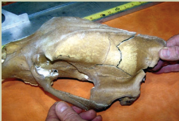
Shattered bear skull with its posterior part shot off

This policy does not apply to skulls that have been