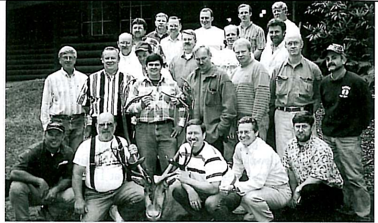
PARTICIPANTS OF THE OFFICIAL MEASURER TRAINING WORKSHOP HELD AT THE CAMP FIRE CLUB IN NEW YORK, DURING JULY 21-25, 1997.