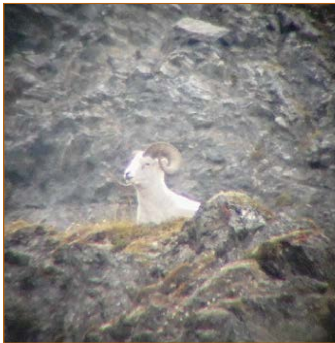
The old ram perched upon a tall rock spire, surveys all of his domain below.

With only a couple hours of daylight left, the ram finally stood and moved from his spire, disappearing in the crags. We readied for a possible shot opportunity, and as fate would have it, the rams emerged one-by-one, walking single-file down and to the right of the cliffs. The biggest ram followed the back of the group as they moved out toward a green slope to feed.