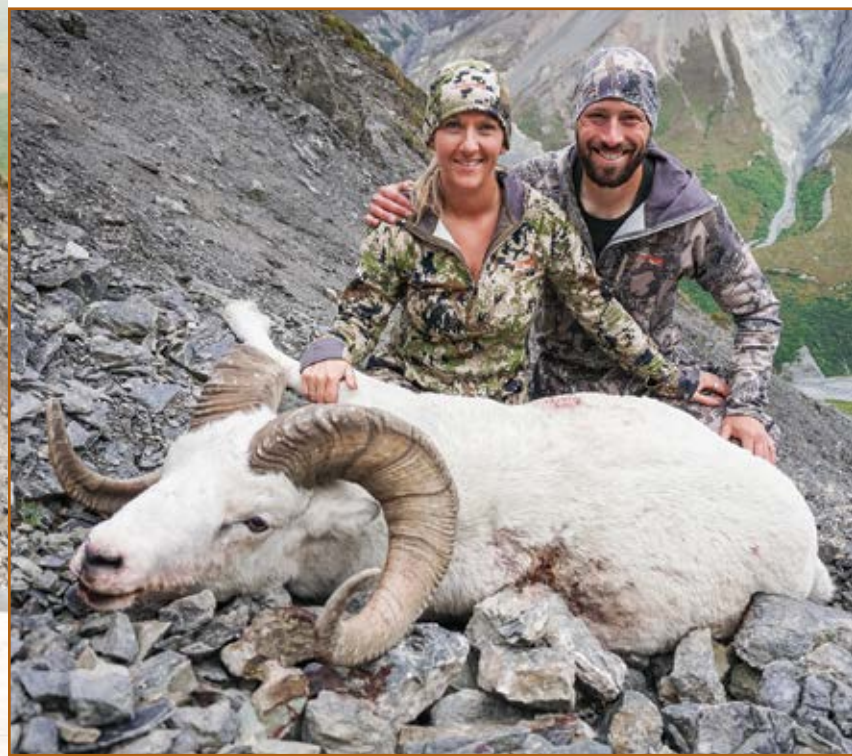
The only thing better than sheep hunting, is getting to share the experience with someone.