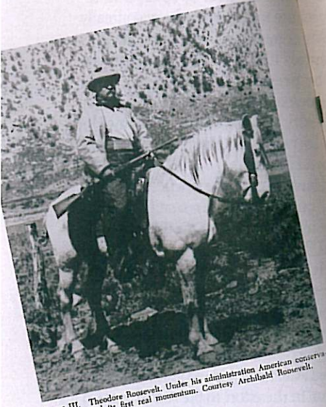
PLATE III. Theodore Roosevelt. Under his administration American conservation gained its first real momentum.