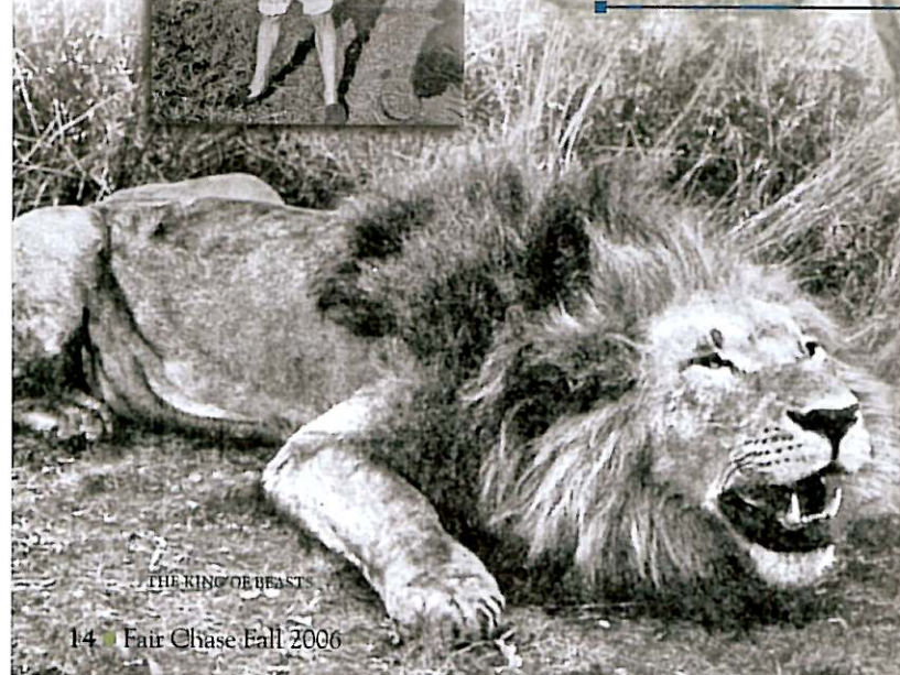
THE KING OF BEASTS