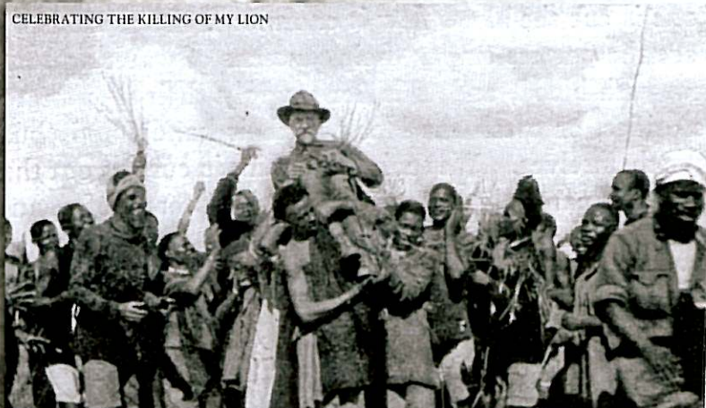
CELEBRATING THE KILLING OF MY LION