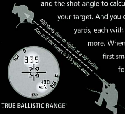
TRUE BALLISTIC RANGE™

HUNTERS. Other rangefinders measure just the straight line distance to the target. Only the RX uses your rifle's or bow's ballistics and the shot angle to calculate a holdover/holdunder point, an MOA adjustment, or the equivalent horizontal range to your target. And you can customize more than the ballistics...choose from 4 RX models that precisely range up to 1,500 yards, each with 13 selectable reticles, measurements in feet, yards or meters, temperatures in °C or °F, and much more. When it comes to the shot of a lifetime, you want more than a glorified tape measure. You want the first smart rangefinder for hunters, the RX from Leupold®. Call 1-800-929-4949 for your nearest Leupold Dealer, or visit www.leupold.com .