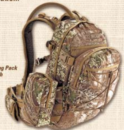
BlackSummit™ Hunting Pack with Accessory Pouch

Enjoy the same high-performance, no-compromise gear as U.S. Special Operations & Law Enforcement professionals, like our full line of Hunting Packs with integral hydration.