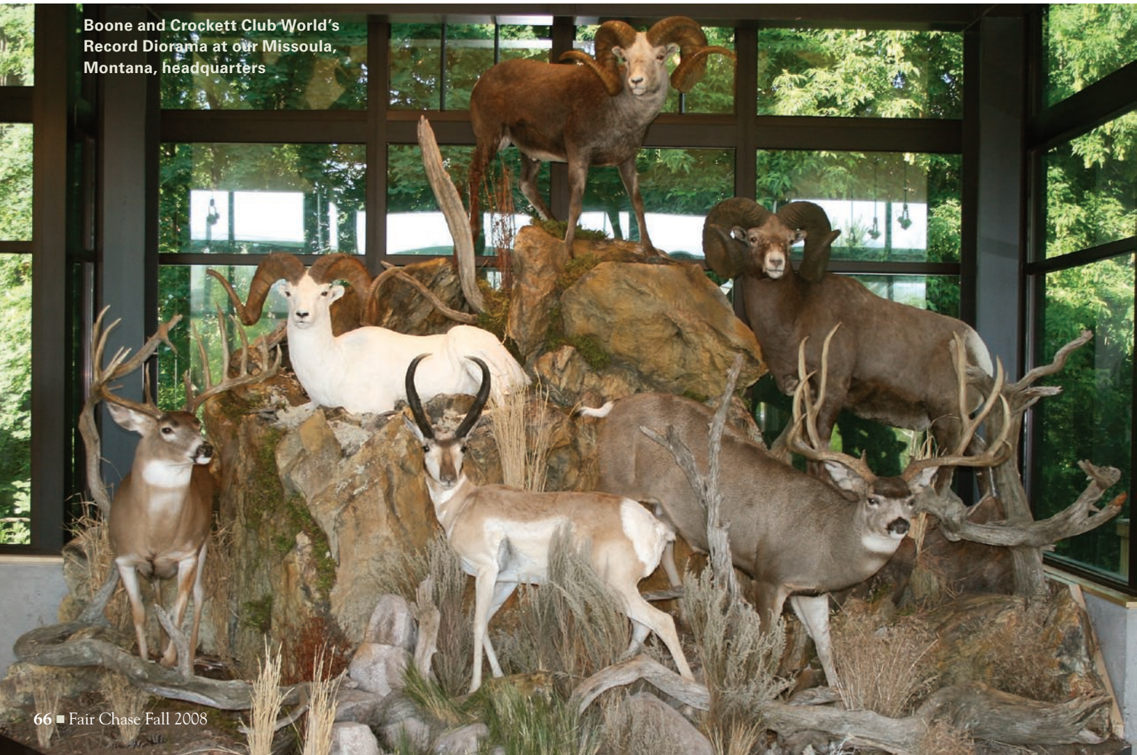
Boone and Crockett Club World's Record Diorama at our Missoula, Montana, headquarters

I would like to draw your attention to a really screaming deal on the Official Measurer shirts (M, L, XL, and XXL) featured on the Official Measurers Community. They have been discounted to $39.95. These khaki-colored Buzz Off™ canvas camp shirts are