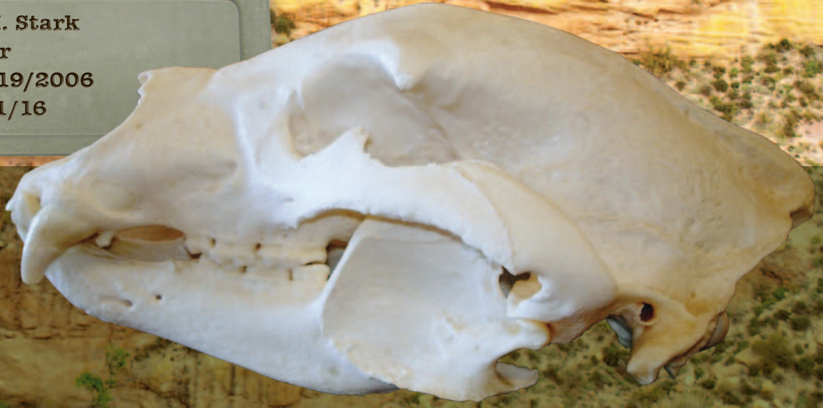
Bryce D.K. Stark Black Bear Taken: 8/19/2006 Score: 21-1/16