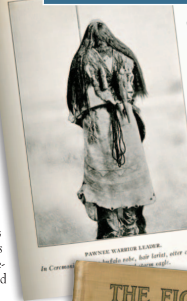
PAWNEE WARRIOR LEADER. In Ceremony. Buffalo robe, hair lariet, otter cap.