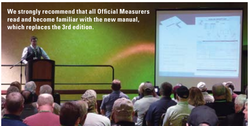
We strongly recommend that all Official Measurers read and become familiar with the new manual, which replaces the 3rd edition.