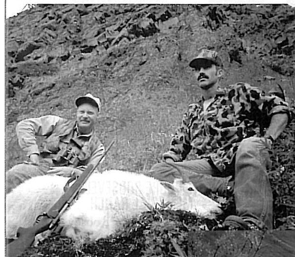
LEFT: THIS NORTHERN B.C. BILLY WAS TAKEN IN LATE AUGUST. BILLIES TEND TO GET THEIR WINTER COATS MUCH EARLIER THAN NANNIES, BUT THE LATER THE BETTER FOR THE VERY BEST PELTS. BELOW: TAKING A BREAK AT THE BOTTOM AFTER PACKING OUT A GOAT. THIS WAS THE END OF A VERY LONG DAY!

In both British Columbia and Alaska nonresidents are obligated to hire a guide, which increases costs considerably. However, there's good news and more good news. First, due to inexplicably limited demand, guided goat hunts are quite reasonable, having escaped the runaway inflation of guided sheep hunts. Second, throughout most of B.C.'s mountain ranges and virtually all of southeast Alaska goats are an underhunted resource. Great billies die of old age each year—many, I suspect, without ever seeing a hunter. I hope it stays that way, for goat hunting is something I'd like to do more of while I've still got the legs and lungs for it. And not because it's a poor man's sheep hunt, but because the goat offers great hunting in his own right!