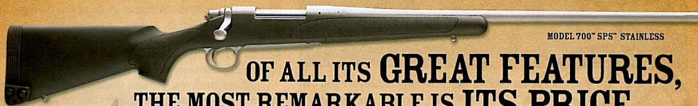
MODEL 700™ SPS™ STAINLESS

OF ALL ITS GREAT FEATURES, THE MOST REMARKABLE IS ITS PRICE.