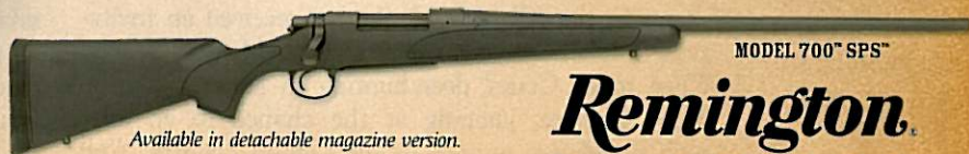
MODEL 700™ SPS™

Available in detachable magazine version.