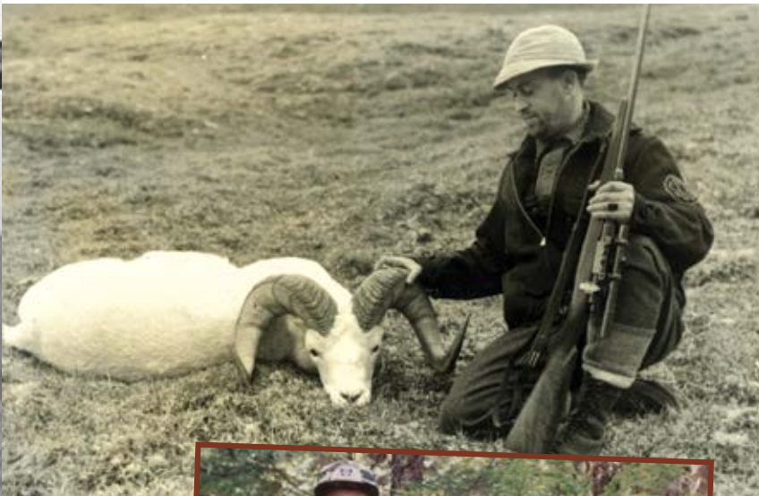
Showing respect for the hunted comes naturally and this appears in our photography.