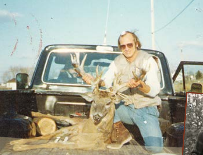
Sometimes hunting photography is taken in some unusual places, but one of these places is not the tailgate.