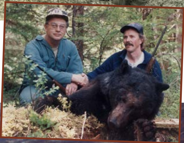
The congratulatory handshake has helped celebrate the moment from day one.