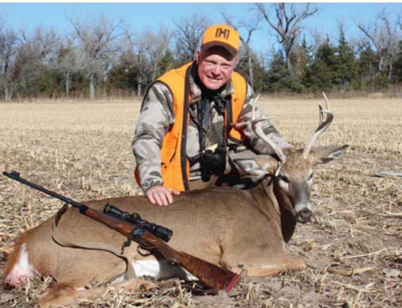
LEFT: Part of hunting is that almost any shot can go wrong, for innumerable reasons. Shooting from a steady rest, I hit this Nebraska whitetail too far back. Fortunately, we were able to recover him! RIGHT: My best Dall's sheep was taken in Yukon at a bit over 500 yards. Distance is a factor in the "shoot" decision, but that depends on conditions. That afternoon was dead calm, I was rested over rolled-up sleeping bags, and I knew the distance and rifle.

The good news on a bedded animal is that, at the