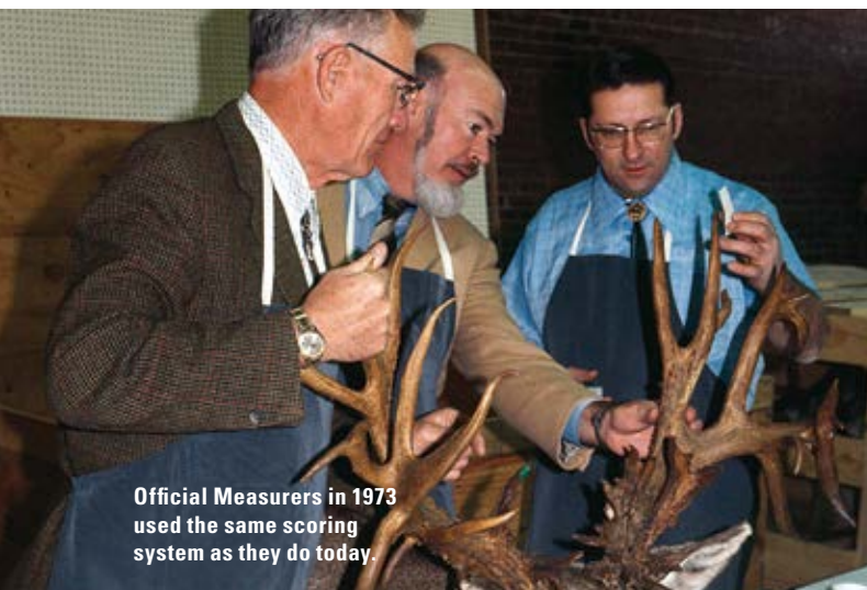
Official Measurers in 1973 used the same scoring system as they do today.

Score charts are available for download online at www.Boone-Crockett.org