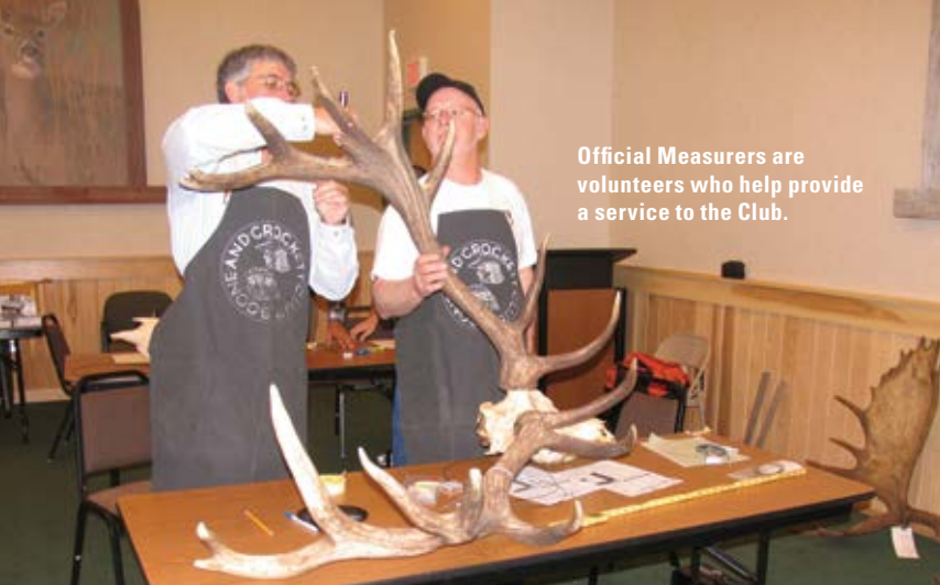
Official Measurers are volunteers who help provide a service to the Club.

toolbox just by following the limited instructions on the front of the score chart. Tools include a roll of masking tape, pencil, quarter-inch-wide flexible steel measuring tape, carpenter's level, and a folding carpenter's ruler or some other straight edge. If you don't have all these tools, you can probably improvise. The idea is to arrive at an approximate score for your trophy to see if you should pursue the matter further and contact a B&C Official Measurer. If you don't have the tools, our resource is listed at the bottom of this article.