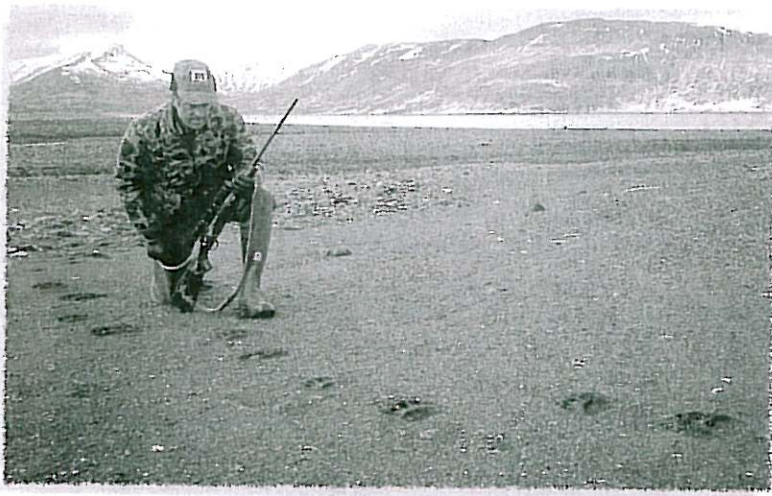
LARGER BEARS ARE USUALLY FOUND NEAR COASTAL AREAS. THIS HUNTER EXAMINES BROWN BEAR TRACKS ALONG THE BERING SEA COAST.

population size and composition. Aerial counts of bears concentrated along salmon streams is one technique used in some parts of the state where the tree/brush cover is minimal. We are evaluating this technique to see if trends in bear abundance can be detected on the Alaska Peninsula. Past studies by the department have shown that even under the best circumstances we are able to see fewer than half the bears known to be present in a survey area. Although the results appear encouraging, this technique is best applied in areas where a dense bear population uses a stable fish run in open habitat where bears are easily seen.