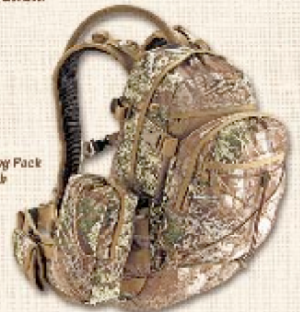
BlackHawk® Hunting Pack with Accessory Pouch

Enjoy the same high-performance, no-compromise gear as U.S. Special Operations & Law Enforcement professionals, like our full line of Hunting Packs with integral hydration.