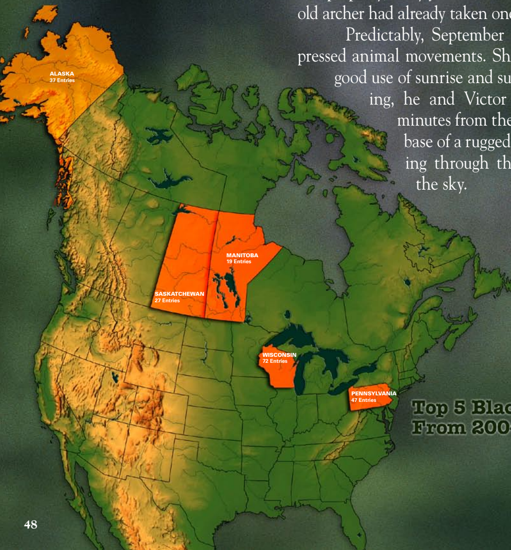
Top 5 Black Bear Locations From 2004-2007