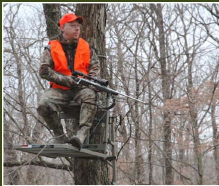
BELOW LEFT: Many black bears have been shot by deer hunters from tree stands in Eastern hardwoods. BELOW: In the Mountain West, black bears can be hunted like elk during fall seasons.