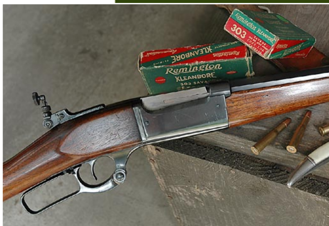
ABOVE: You don't need a new rifle or a potent one for black bears. This old M99 in .303 Savage suffices. RIGHT: Black bears like thick cover, and can slip through brush that effectively stops hunters.

When I was a lad, deer rifles were also black bear rifles. The .30-30 ruled eastern woodlots where rifles were legal, though it was often whispered that the .35 had an edge for bears. I shot my first bruin with a .303 British, an iron-sighted rifle for which I paid $30. Now most hunters carry more potent rifles. Scopes have replaced open sights. It's not much of a stretch to say any common deer rifle will dispatch black bears. Ditto for shot-guns hurling 20- or 12-gauge slugs.