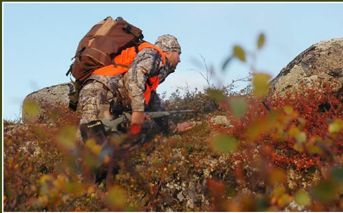
LEFT: Try to stay hidden during an approach. Bears are more alert and see better than you might think!

Few animals can be hunted in as many ways as the black bear. With a range as broad and tall as the United States, it inhabits mountains and swamps, forests and farm fringes—even tundra.