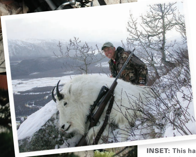
INSET: This hard-won goat won't make the books, but the climb and descent made the hunt memorable.