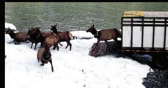
TOP: The elk off-loading from a truck at the Brem River. BOTTOM: At the Homathko River estuary just following the release of the elk.

The Roosevelt's elk boundary in British Columbia includes all of Vancouver Island and all of the islands in the Strait of Georgia. On the mainland, the boundary includes all of the coastal watersheds of Butte Inlet at the north to Frazer River, Harrison River/Harrison Lake and the Lillooet River and all its tributaries at the south.