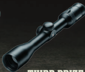
THIRD PRIZE Z3 3-9x36