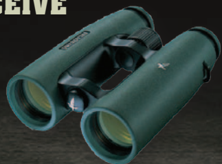
SECOND PRIZE EL 10x42 WB