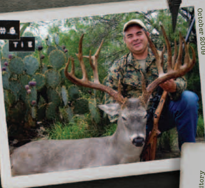
Non-Typical Whitetail - 210 5/8 Beane R. Barrington La Salle County, Texas October 2009