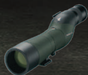
FIRST PRIZE STM 65 HD