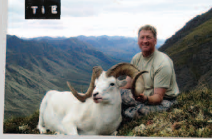
Byron Whitney Dalls Sheep - 160 2/8 Snake River, British Columbia August 2009