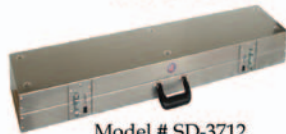
Model # SD-3712