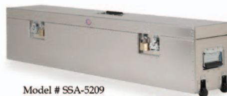
Model # SSA-5209