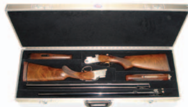
Model # SP-3712