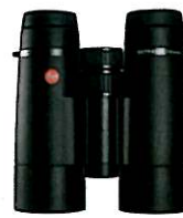
ULTRAVID 7x42, 8x42 and 10x42.