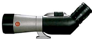
TELEVID 62 and APO-TELEVID 62.

Leica is for those who go all out or not at all. With a level of optical and mechanical excellence that honors our 150 years of expertise. Whether it's the Ultravid binocular, the Televid spotting scope, or the much-anticipated Geovid BRF rangefinding binocular. Each is the best of its category. Thanks to uncompromising design. Best available materials. Uncanny ergonomics. Fatigue-reducing lightness. Rugged durability. And unquestionable reliability, backed by fearless warranties. Leica. As authentic as it's ever been.