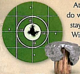
30-06 SPRG, 150-gr Premier® Core-Lokt® Ultra Bonded

Jim's guide lied. The elk was 412 yards away, he told Jim it was under 300. Why? Confidence. You see, he knew Jim wasn't used to long-distance shots but, luckily, he was using Core-Lokt Ultra Bonded ammunition. The guide's recommendation? "Hold on top of his back - take the shot."