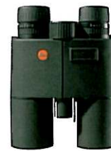
NEW. GEOVID BRF 8x42 and 10x42.