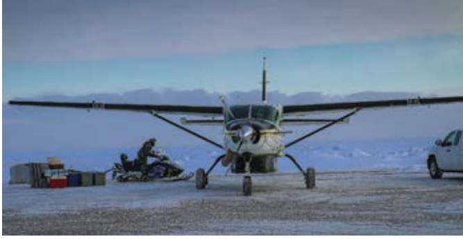
THE MEKORYUK "AIRPORT".