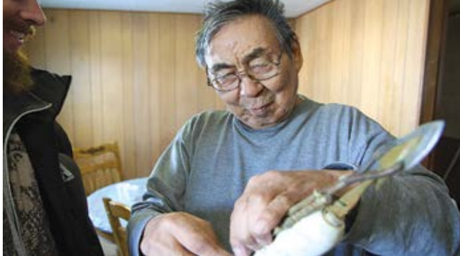
A LOCAL ELDER DEMONSTRATES HIS TECHNIQUE FOR HARPOONING SEALS.