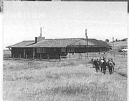
RIGHT: Grizzly Riders return to the main ranch house after a day touring TRM Ranch.