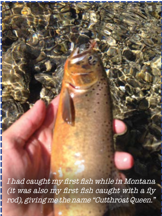
I had caught my first fish while in Montana (it was also my first fish caught with a fly rod), giving me the name “Cutthroat Queen.”

started as a gorgeous emerald green and blended into a royal blue in the center. And the water is cold! I experienced the coldness firsthand by hurling myself over a 25-foot cliff into frigid water. It was quite a change from the warm Atlantic Ocean I am used to.