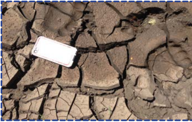
Seeing bear tracks, bighorn sheep and mountain goats, crystal-blue lakes, and a completely different variety of plants for the first time really showed me how diverse this land is and how we need to protect it for everyone to be able to see.