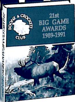
21st Big Game Awards 1989-1991 $39.95