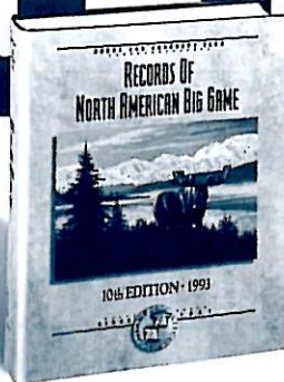
Records of North American Big Game 10th Ed. - $49.95