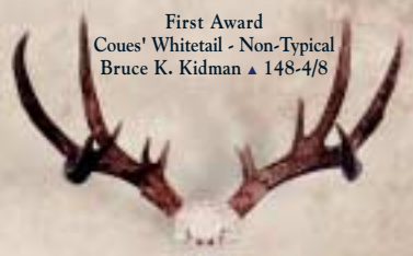
First Award Coues' Whitetail - Non-Typical Bruce K. Kidman ▲ 148-4/8