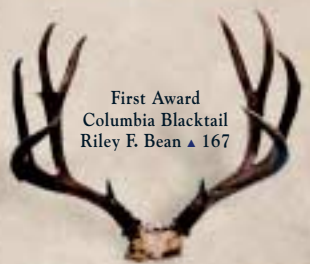
First Award Columbia Blacktail Riley F. Bean ▲ 167