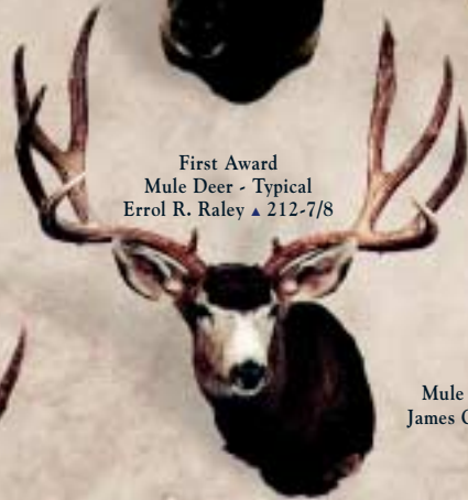
First Award Mule Deer - Typical Errol R. Raley ▲ 212-7/8