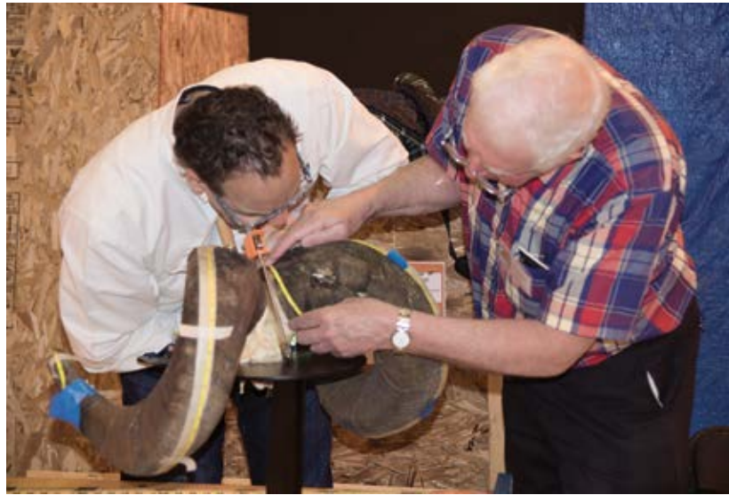
The 29th Awards Program Judges Panel will meet in April to verify the scores of the trophies entered.