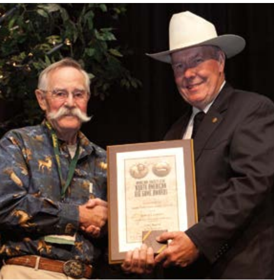
ABOVE: Each trophy owner will be recognized individually on stage and presented with a plaque and medallion in honor of their trophy.

I cannot include an accurate figure for the number of trophies accepted in the 29th Awards Program yet