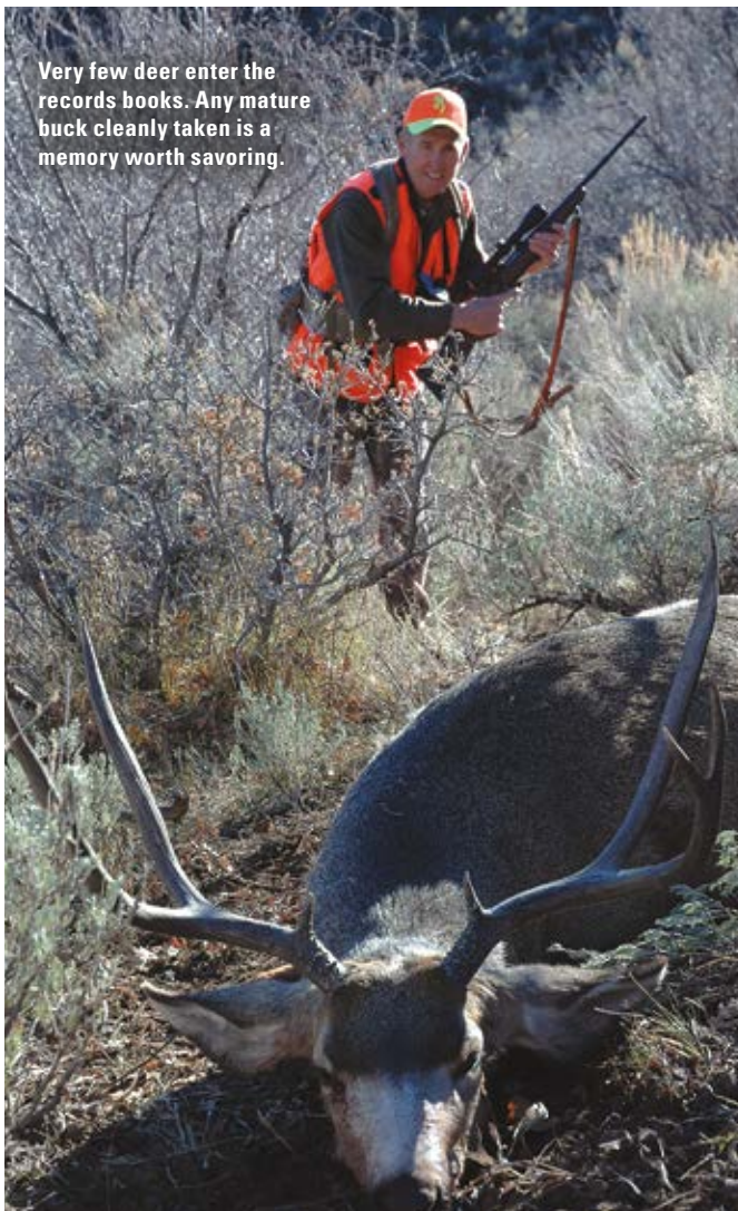
Very few deer enter the records books. Any mature buck cleanly taken is a memory worth savoring.

A gremlin that can ruin your hunt is a loose sight screw. In Namibia hunting eland, I ambushed a bull at dusk. The roll of the earth permitted a prone shot. To my amazement, the eland ran off paunched. At camp next morning I fired to confirm zero. The bullet struck true. Puzzled, I fired again, and that shot landed six inches to three