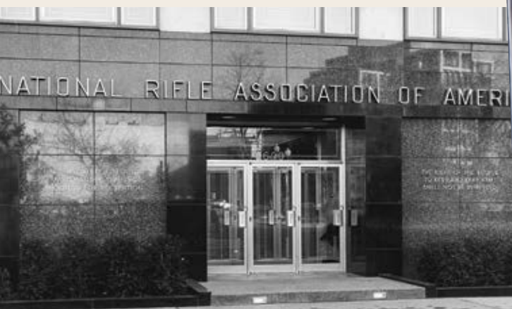
The Boone and Crockett Club partnered with the NRA from 1973 to 1980 to help with record keeping and formalize Official Measurer's training workshops.