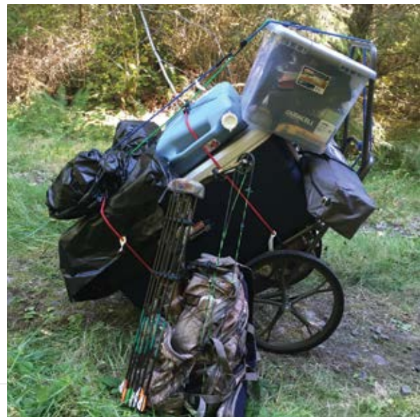
Getting creative while hiking out ten days worth of camp gear. After a long search, with not much sleep, I'm thankful it's mostly a downhill cruise. The meat cooler doubles as a gear tote when coming in or going out on unsuccessful trips.