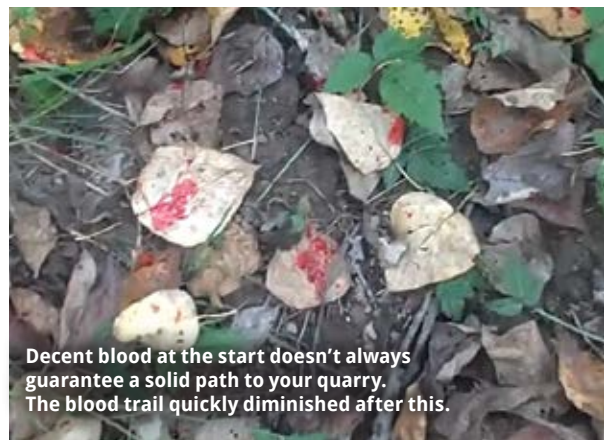
Decent blood at the start doesn't always guarantee a solid path to your quarry. The blood trail quickly diminished after this.