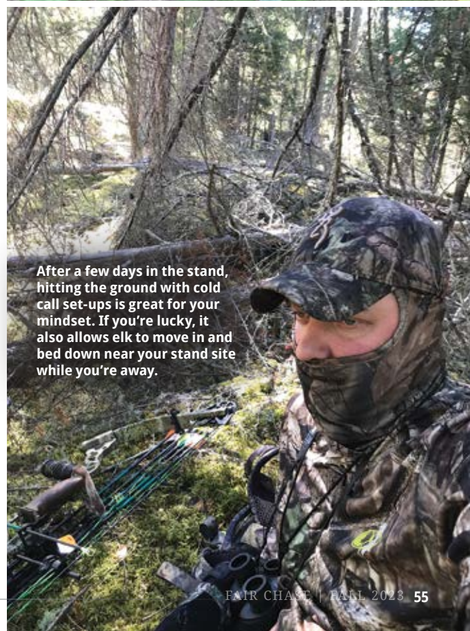
After a few days in the stand, hitting the ground with cold call set-ups is great for your mindset. If you're lucky, it also allows elk to move in and bed down near your stand site while you're away.