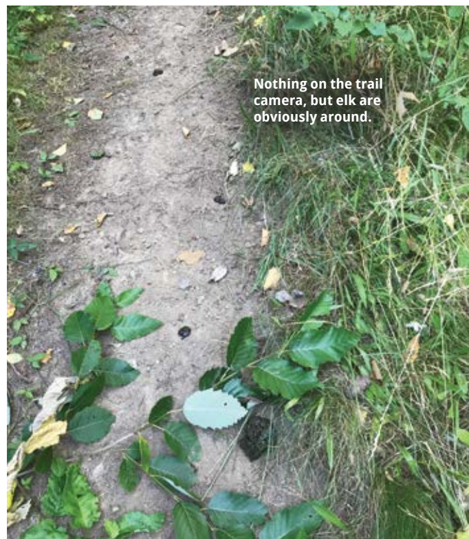
Nothing on the trail camera, but elk are obviously around.

Forty-five agonizing minutes wore on when local thermals started getting shiftier. I was now feeling the light breeze blowing into the left side of my face. Because of the change in wind direction, the injured 5x5 got his first whiff of the